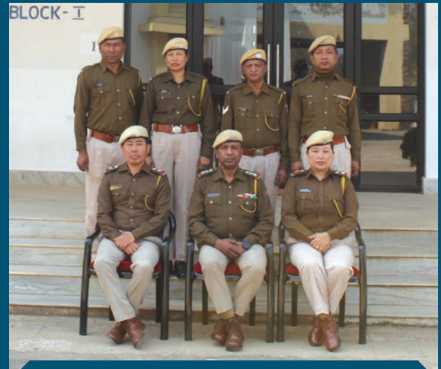
TRAINING BRANCH (INDOOR)