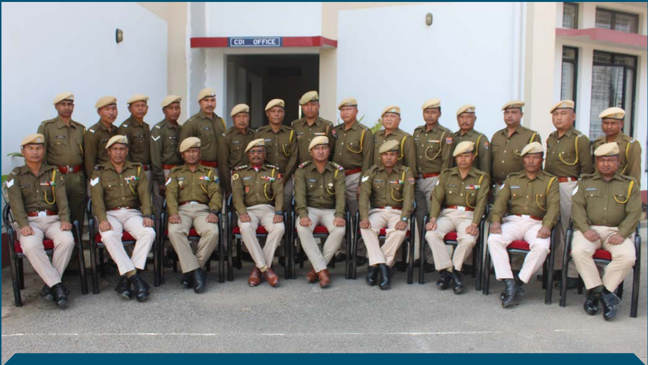
TRAINING BRANCH (OUTDOOR)