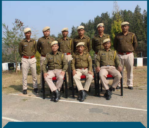
MAGAZINE GUARD & GENERAL DUTY