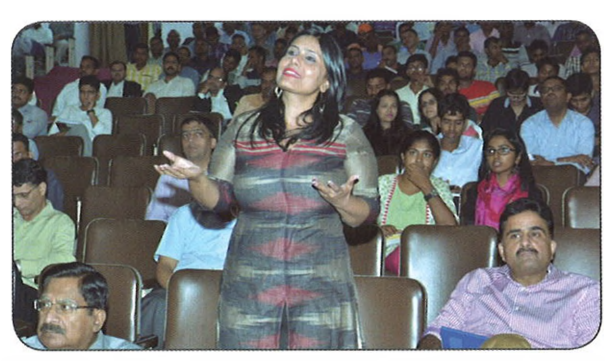
An interactive session of the Indian Police Foundation