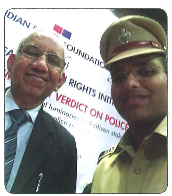
Former Chief Justice of India Shri R. C. Lahoti launched the #MySelfieWithaCop campaign at the police reforms conference

The Indian Police Foundation has been engaging in a nationwide campaign for police reform. As part of a campaign for bringing the police and citizens together, the Foundation launched the #MySelfieWithaCop campaign, calling upon citizens to take a selfie with a policewoman or a policeman in uniform and post it on the Facebook, Twitter, Local Circles page of the Indian Police Foundation. Selfies can be taken with the neighbourhood beat constable or any other policewoman or policeman, including those of State Police and Central Police Organizations (eg. CRPF, BSF, CISF, ITBP, NDRF, SSB) Fire Forces etc. Former Chief Justice of India Shri R. C. Lahoti launched the campaign at the police reforms conference.