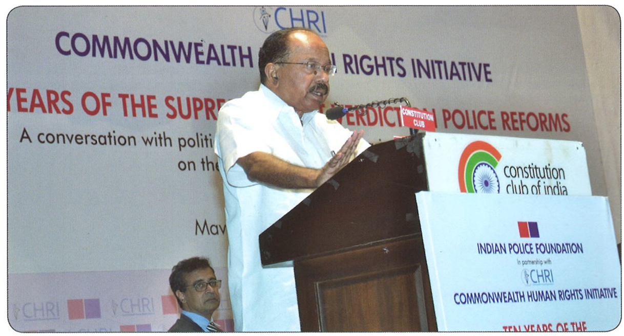
Shri Veerappa Moily, former Union Law Minister, former Chief Minister of Karnataka and the Chairperson of the Second Administrative Reforms Commission speaking at the Indian Police Foundation Conference on Police Reforms.